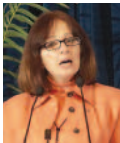
The Honourable Leona Dombrowsky, Ontario Minister of Agriculture, Food and Rural Affairs, met with the OCA Board before taking the stage after lunch.