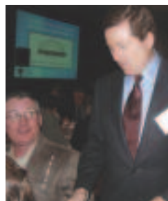
John Tory, MPP and Leader of the Official Opposition speaks with attendees of the OCA Annual Banquet.

procedure that we have in the United States, but we are doing everything we can." Resolutions covered such issues as compensation for cull cows, predation, age verification, CAIS, disease management, Northern slaughter facilities and checkoff on dairy cattle.